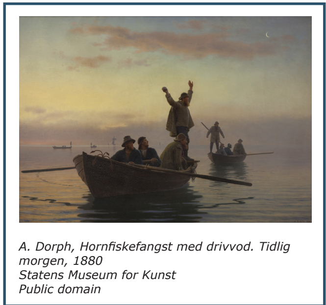
A. Dorph, Hornfiskefangst med drivvod. Tidlig morgen, 1880 Statens Museum for Kunst Public domain

Work straight in pattern until the armholes measure